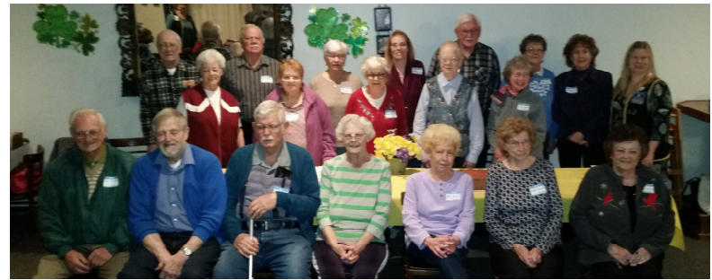
Brothers and Sisters present to receive their membership pins 3/22/16