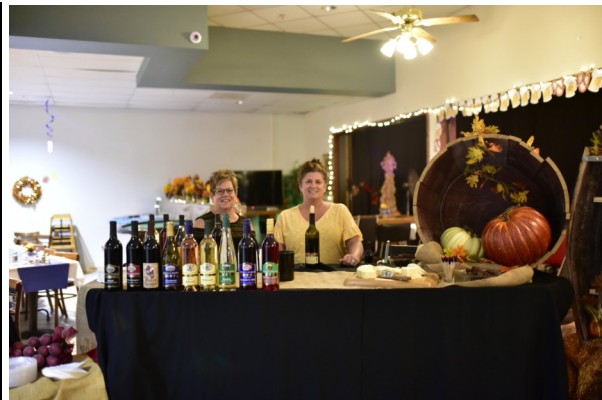
Wine tasting event that happened at the Aerie