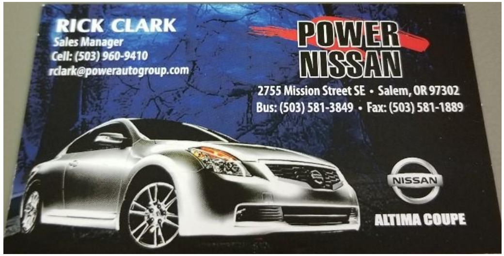
Nissan donated 2 courtesy vans for use during the State Convention! Thank You Nissan