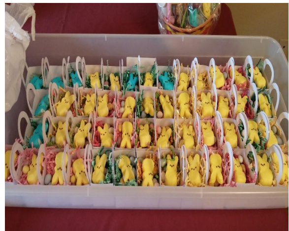
50 Easter Bunny Baskets