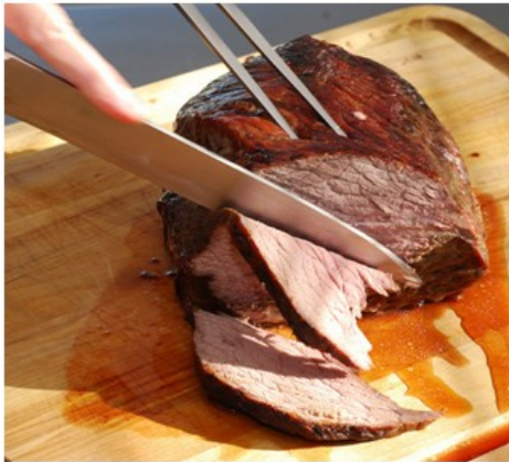
First Auxiliary Dinner in 2018..... Monday, January 08, 2018, at 5:30pm Roast Beef Dinner with potatoes, Veggie, Salad, Rolls, & Dessert.