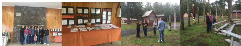
Fraternal Order of Eagles

Your Eagle Riders have been busy raising monies to be able to make a generous donation to our charity again this year. On October 2 nd a group of our members went to Camp Taloali and presented them with a check for $900. Our current fundraisers are 50/50 on meeting nights, Eagle Passports for $7 each, and Eagle lighted caps for $20 each. All proceeds of our fundraising efforts go to our charity, Camp Taloali. We are actively seeking new members, everyone is welcome , and you don't have to have a motorcycle to join. Please feel free to come see what we are all about. The Eagle Riders Club meets on the 4 th Thursday of each month at 7:30pm.