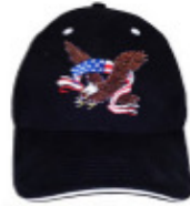
Light Up Eagle Hat