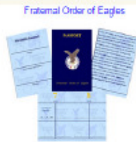
Fraternal Order of Eagles

Your Eagle Riders are busy raising monies to be able to make a generous donation to our charity again this year. We are selling tickets to raffle off a Traeger Grill. The tickets are $5 each and we will sell until 200 tickets have been sold. Locate a Riders member to purchase your ticket. Our other current fundraisers are 50/50 on meeting nights, Eagle Passports for $7 each, and Eagle lighted caps for $20 each. All proceeds of our fundraising efforts go to our charity, Camp Taloali. We are actively seeking new members, everyone is welcome, and you don't have to have a motorcycle to join. Please feel free to come see what we are all about. The Eagle Riders Club meets on the 3 rd Friday of each month at 6:30pm.