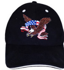
Light Up Eagle Hat

The Eagle Riders Club meets on the 3 rd Friday of each month at 6:30pm. Our current fundraisers are 50/50 on meeting nights, Eagle Passports for $7 each, and Eagle lighted caps for $20 each. All proceeds of our fundraising efforts go to our charity, Camp Taloali. We are actively seeking new members, everyone is welcome, and you don't have to have a motorcycle to join. Please feel free to come see what we are all about.